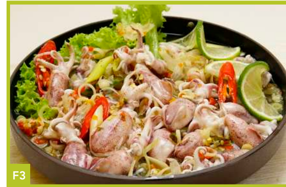
F3 Pla Muek Nueng Manow 🌶️ Steamed Baby Squid with Lemongrass 19