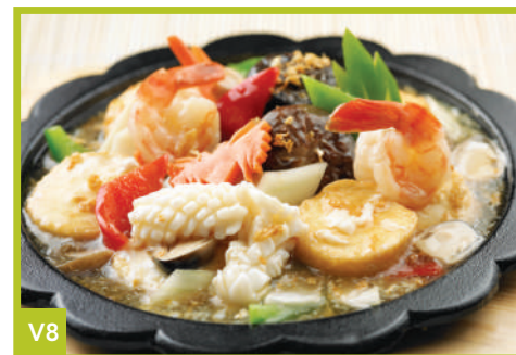
V8 Tao Hoo Chanron 🍴🌶️ 16.8 Hotplate Seafood Tofu with Garlic / Chilli Simmering Hotplate Beancurd 14.8