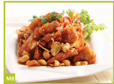
M8 Gai Ob Num Pheung Fried Chicken with Honey & Garlic Sauce 14.8