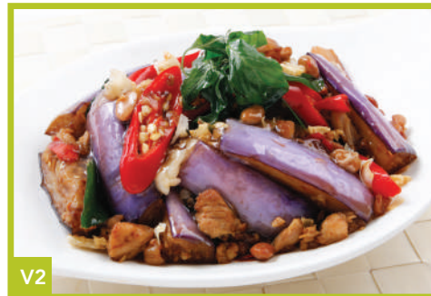
V2 Ma Kher Phad Bai Krapow 🍴🌶️ 14.5 Eggplant with Minced Chicken & Basil Leaves