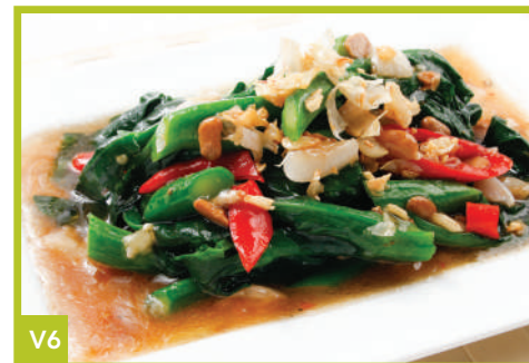
V6 Phad Thai Kana 🌶️ 12.8 Kai Lan with Oyster Sauce / Chilli Paste