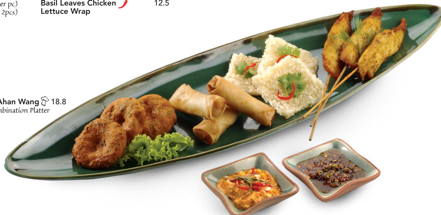
A9 Si Ahan Wang 🍳 18.8 Combination Platter

Bali is known as the “island of a thousand temples”. Many claim that there are actually more temples than homes in Bali.