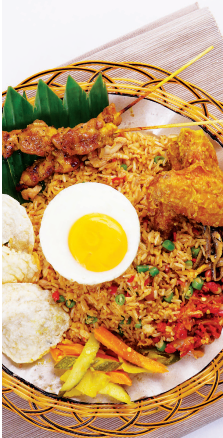
R1 Nasi Goreng Istemewa 🍴🌶️ 18.5 with Satay, Egg & Crackers