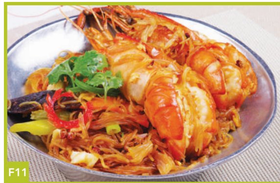
F11 Goong Ob Woonsen 32 Thai Style Prawn Tang Hoon