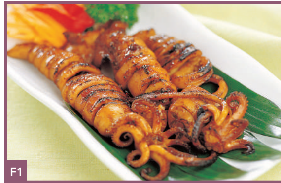
F1 Cumi Bakar / Sambal 🍴 Grilled Cuttlefish with Sweet Sauce Stir-fried Cuttlefish with Sambal Chilli & Petai 🌶️ 19.8