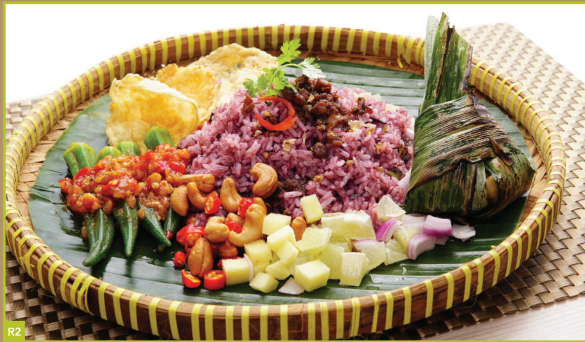
R2 Black Olive Rice Set 16.8 with Pandan Chicken & Lady's Finger