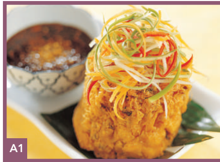
A1 Tahu Telur 🍳 Fried Beancurd with Egg & Served with Special Sauce 11.5