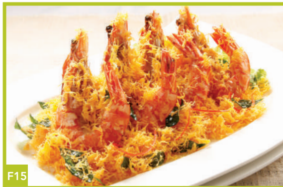
F15 Goong Ob Noey 32 Fried Prawn (Cereal/ Sweet & Sour/ Black Pepper/ Butter Floss)