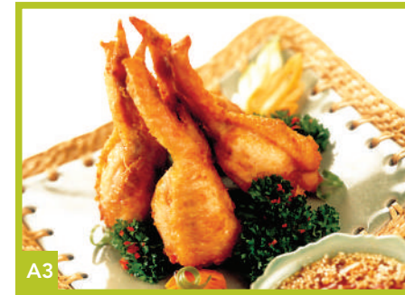
A3 Peek Gai Sod Sai 4.2 (per pc) Stuffed Boneless Chicken Wing (min 2pcs)