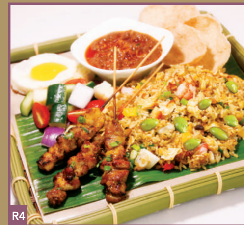
R4 Nasi Goreng Petai with Satay Set 🌶️ 16.8