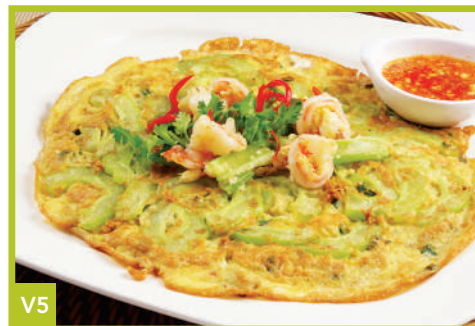
V5 Kai Jiao Ma Ra & Goong 13.8 Omelette with Prawn & Bitter Gourd