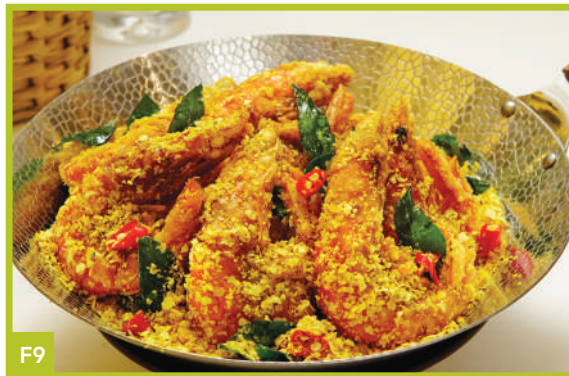
F9 Goong Kao Od 32 Soft Shell Prawn (Cereal/ Sweet & Sour/ Black Pepper/ Butter Floss)