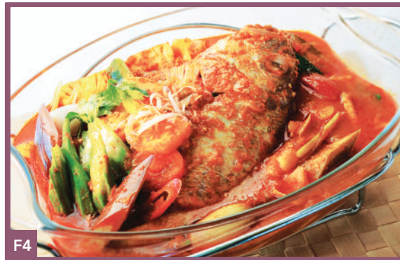
F4 Ikan Asam Pedas 🍴 🌶️ Hot Asam Curry Fish 35