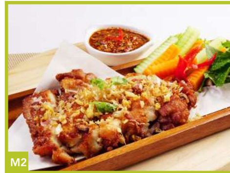
M2 Gai Yang Chiang Mai Chicken 12.5