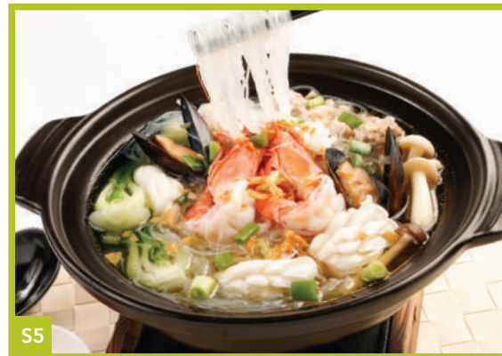
S5 Gaeng Jued Woonsen Talay / Gai Glass Vermicelli Clear Chicken Soup with Seafood 18.8 Chicken Ball 15.8