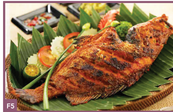
F5 Ikan Bakar Bali 🍴 Charcoal Grilled Fish with Special Sweet Sauce 32