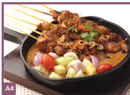
A4 Satay Madura BBQ Skewered Chicken / Beef 12.5 (6pcs)