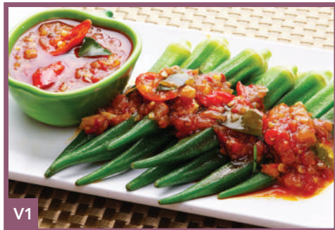
V1 Bendi Belado 🌶️ 10.8 Lady's Fingers with Thick Spicy Sauce