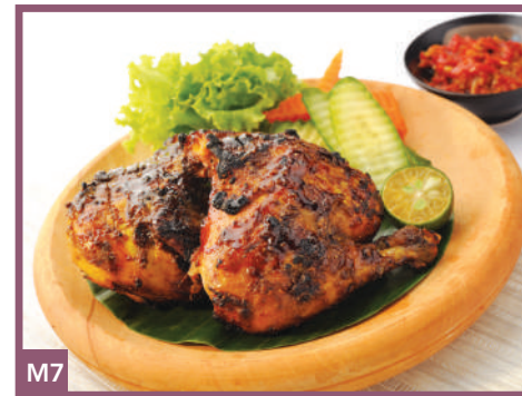
M7 Ayam Panggang Bali 🍴 Grilled Marinated Chicken 12.5