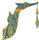
M9 Kaeng Khiao Wan Gai / Nuer 🍴🌶️ Thai Famous Green Curry Chicken 14.8 Beef 16.8

Thailand's royal barge procession is manned by over 2,000 oarsmen and takes place only during the most significant religious and royal events.