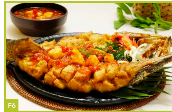
F6 Pla Rad Prik / Yum Ma Muang * 🌶️ Crispy Fish with Thai Chilli Sauce / Mango Salad 35