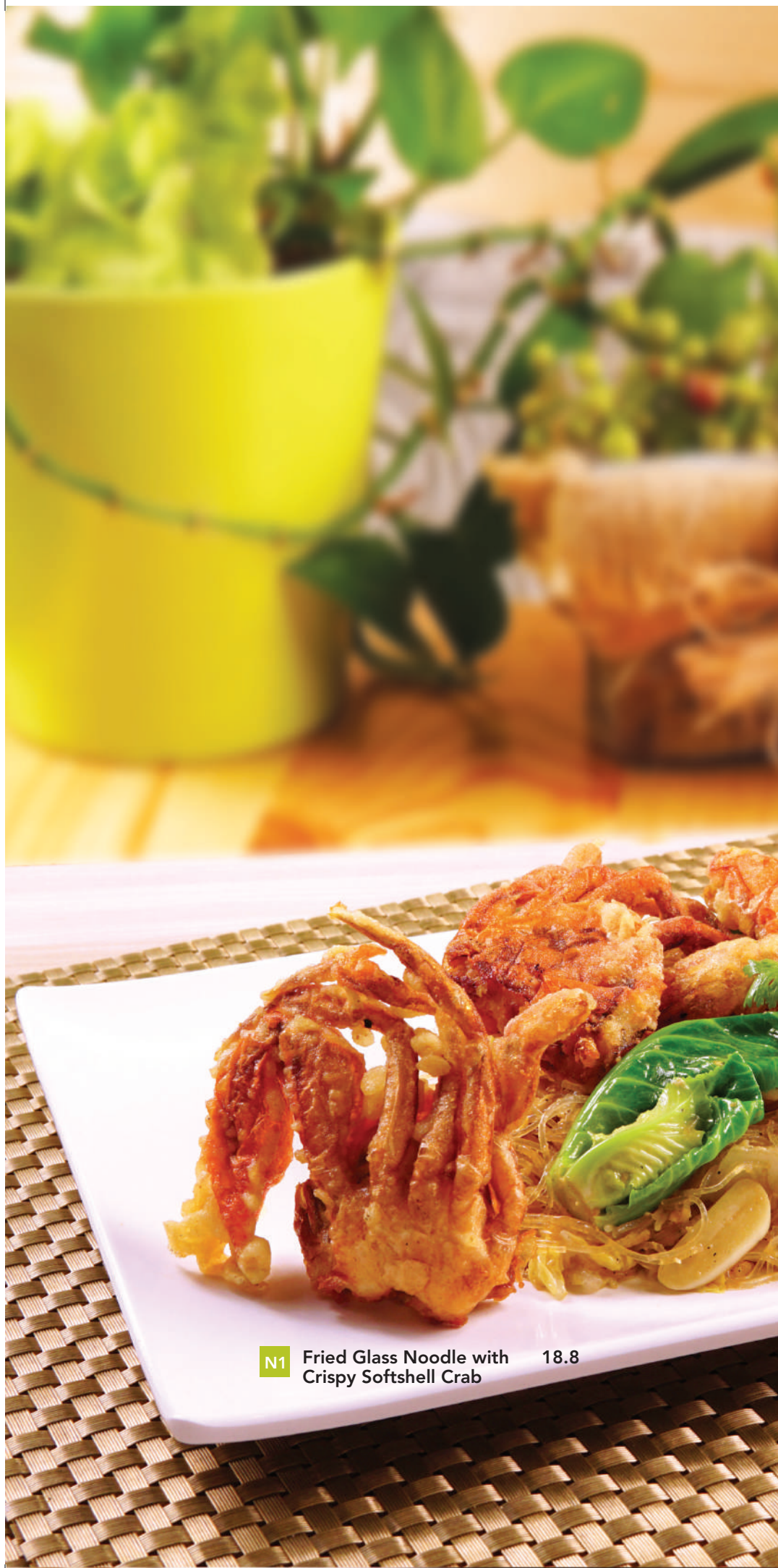
N1 Fried Glass Noodle with Crispy Softshell Crab 18.8