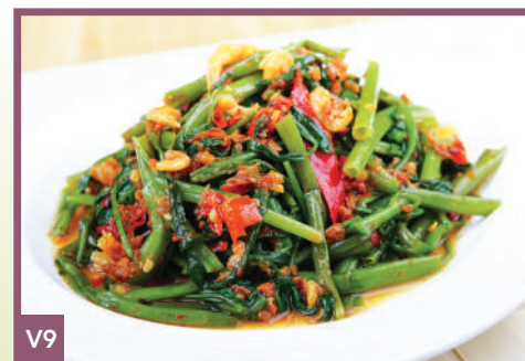
V9 Kang Kong 🍴🌶️ 12.8 Stir-fried Kang Kong with Sambal / Garlic