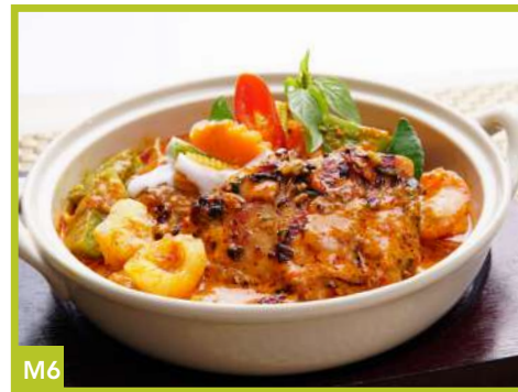
M6 Gaeng Daeng Gai 🌶️ Red Curry Chicken 16.8