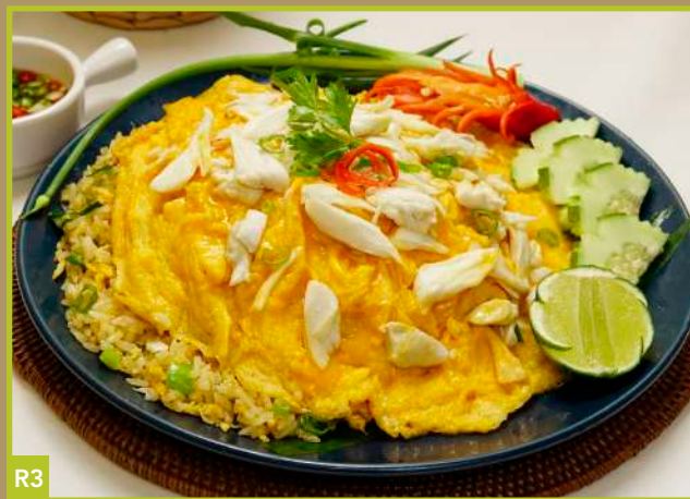
R3 Crab Meat Omelette Fried Rice 23.8 Crab Meat Fried Rice 21