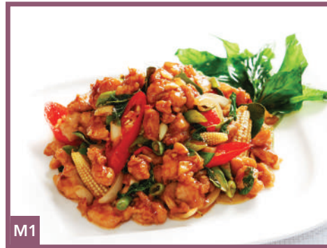
M1 Bai Krapow 🍴🌶️ Chicken Basil 14.8