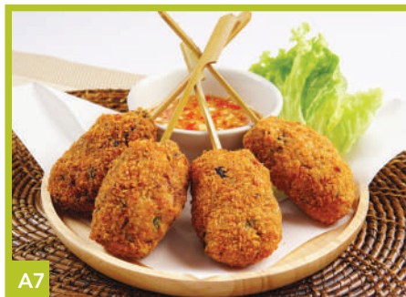
A7 Tod Man Goong 🍳 Thai Prawn Cakes 4.0 (per pc) (min. 2pcs)