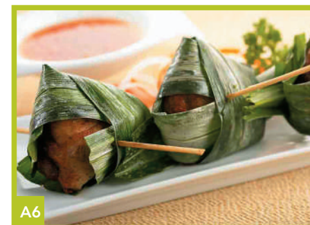
A6 Gai Ho Bi Tuey Pandan Leaf Chicken 4.0 (per pc) (min. 2pcs)