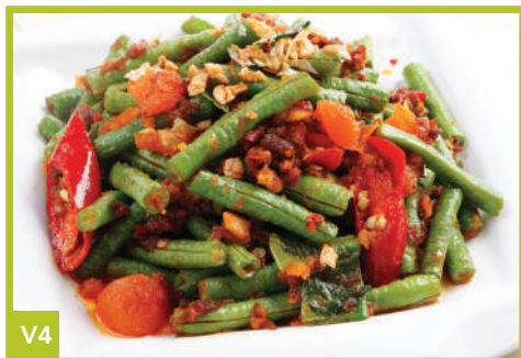
V4 Phad Prik Tour 🌶️ 14.5 Stir-fried Long Bean with Chilli Paste & Salted Egg