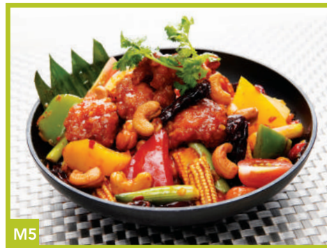
M5 Gai Phad Medmamuang 🌶️ Chicken with Dried Chilli & Cashew Nut 16