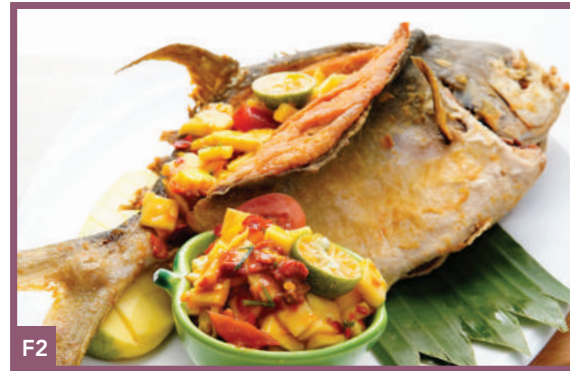
F2 Ikan Goreng Sambal Manga 🌶️ Crispy Fish with Sambal Mango 22.8