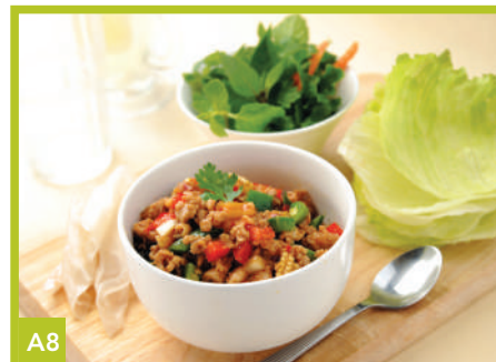
A8 Basil Leaves Chicken 🌶️ Lettuce Wrap 12.5