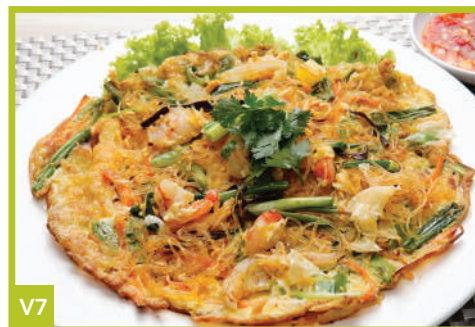
V7 Kai Jiao Pak Woonsen 14.8 Omelette with Prawn & Glass Noodle