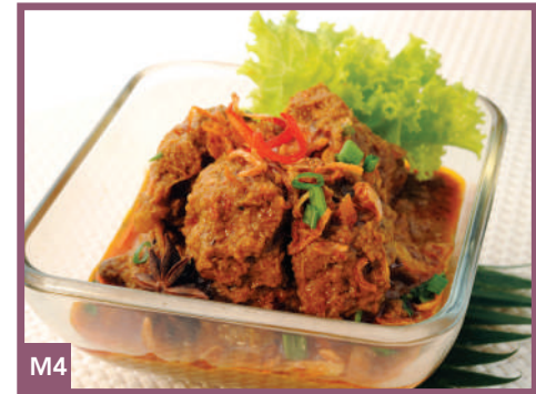
M4 Rendang Sapi 🌶️ Beef in Thick Spicy Dry Coconut Gravy 14.8