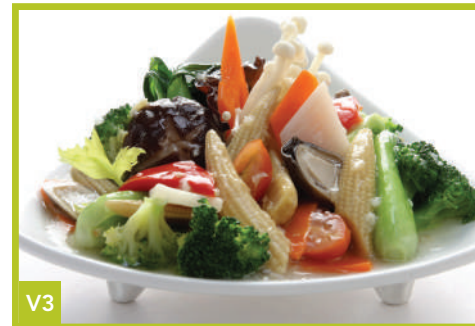
V3 Phad Phak Narm Mun Hoi 13.8 Stir-fried Mixed Vegetables with Oyster Sauce