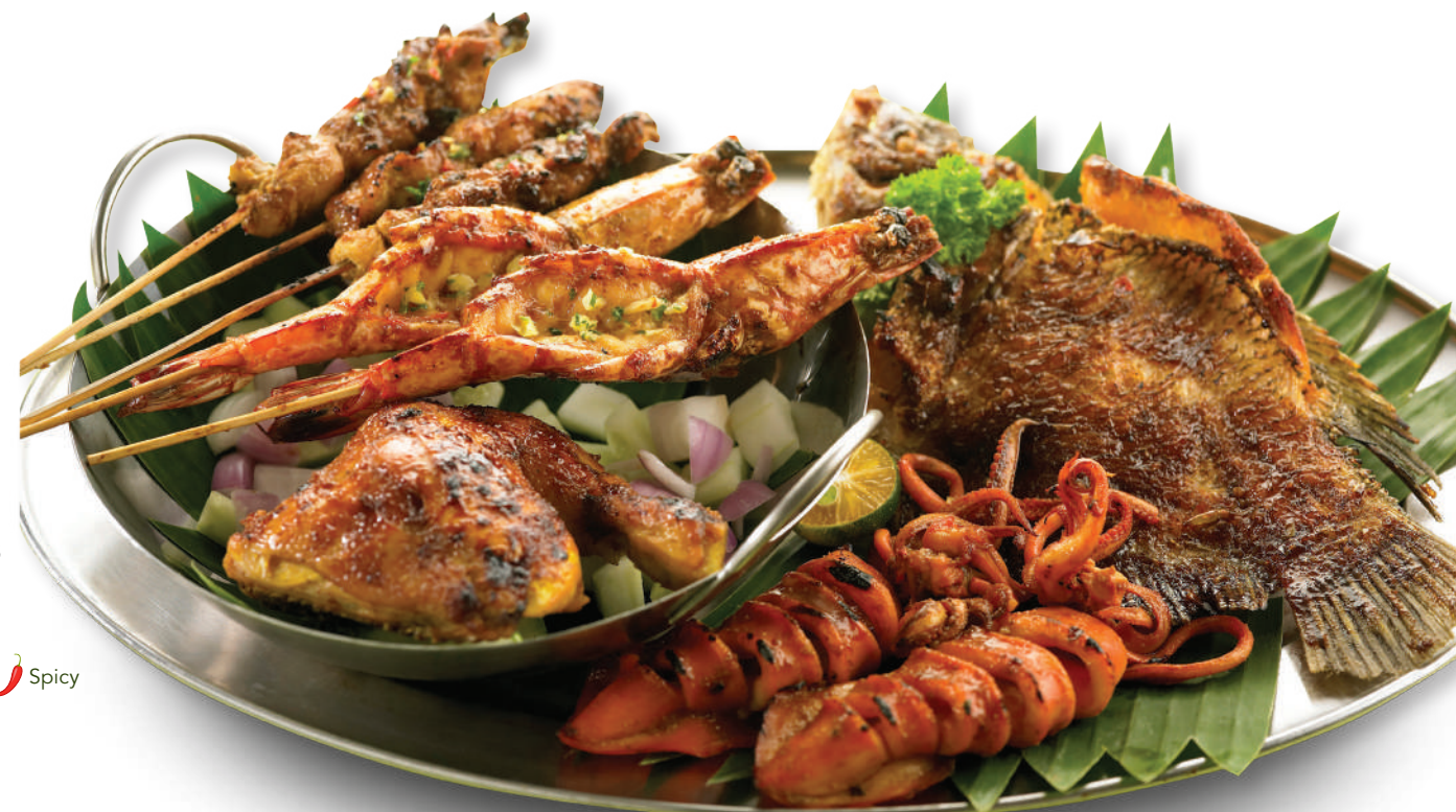
F7 Combi Bakar 🍴 68 Mixed BBQ Platter

~ Indonesian Selection ~ Thai Selection 🍴 Chef's Recommendation 🌶️ Spicy