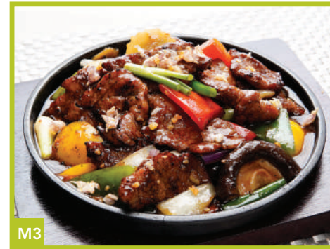
M3 Nuer Chanron 🍴 Hotplate Black Pepper Chicken 16.8 Hotplate Black Pepper Marbled Sirloin Beef 26