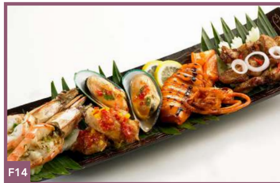
F14 Seafood Bakar 48 Seafood BBQ Platter