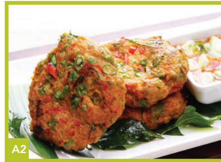
A2 Tod Man Pla 🍳🌶️ Thai Fish Cakes 3.9 (per pc) (min. 2pcs)