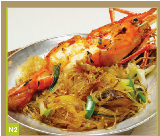
N2 Thai Style Tang Hoon with Scampi Prawn 18.8