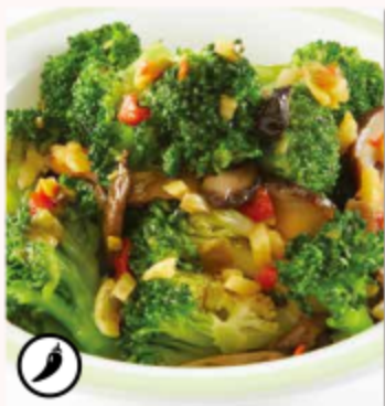
SAUTÉED BROCCOLI 香蒜炒西兰花 Sautéed Broccoli and Mushroom with Garlic