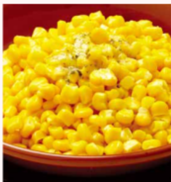
BUTTER CORN 香蒜牛油玉米 Sweet Corn with Garlic Butter