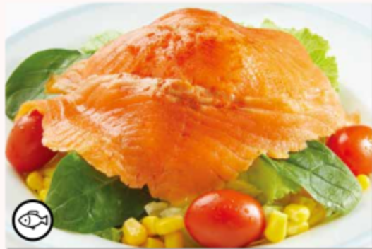
SALMON SALAD 三文鱼沙拉 Smoked Salmon