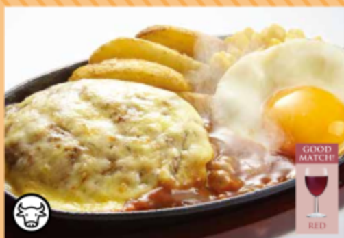
CHEESE HAMBURGER 芝士牛肉汉堡 Beef Hamburger with Mixed Cheese