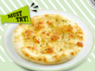
GARLIC FOCACCIA 香蒜披萨包