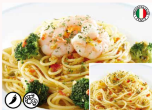
AGLIO OLIO SHRIMP & BROCCOLI 虾仁西兰花香蒜意大利面 Peperoncino Sauce with Shrimp and Broccoli