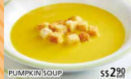
PUMPKIN SOUP S$290 nett