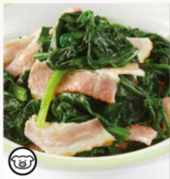
SAUTÉED SPINACH WITH BACON 培根炒菠菜 Sautéed Spinach with Bacon