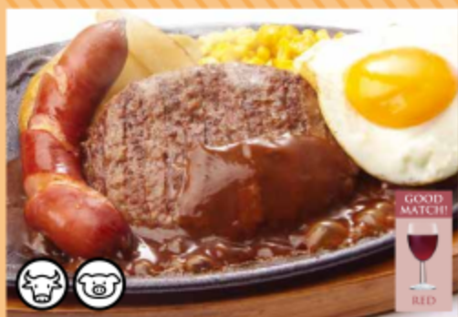
HAMBURGER & SAUSAGE 牛肉汉堡加芝士香肠 Hamburger with Pork Cheddar Sausage