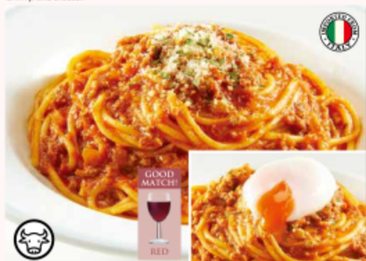
BOLOGNESE 肉酱意大利面 With Beef Bolognese Sauce