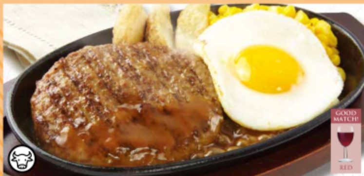
HAMBURGER 牛肉汉堡 Beef Hamburger with Demi Sauce