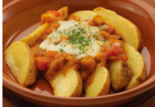
CHEESY CURRY POTATO 芝士咖喱土豆 Potato Topped with Vegetable Curry Sauce and Cheese