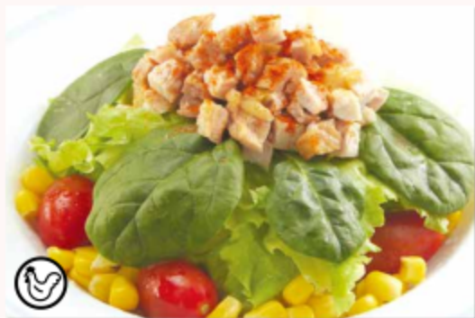
CHICKEN SALAD 鸡肉沙拉 Grill Chicken