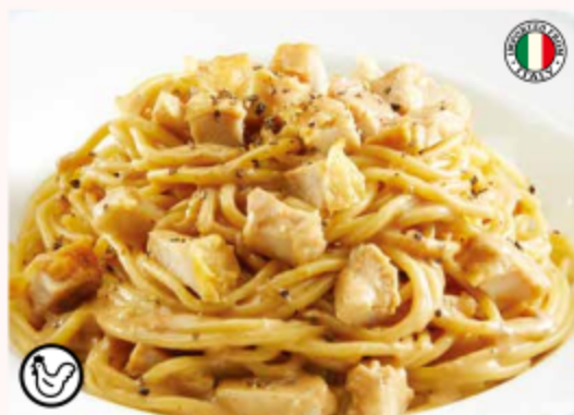
BLACK PEPPER CHICKEN 黑胡椒鸡肉意大利面 Black Pepper Sauce with Grilled Chicken