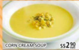
CORN CREAM SOUP S$290 nett