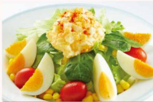
EGG SALAD 鸡蛋美乃滋沙拉 Egg, Mayonnaise