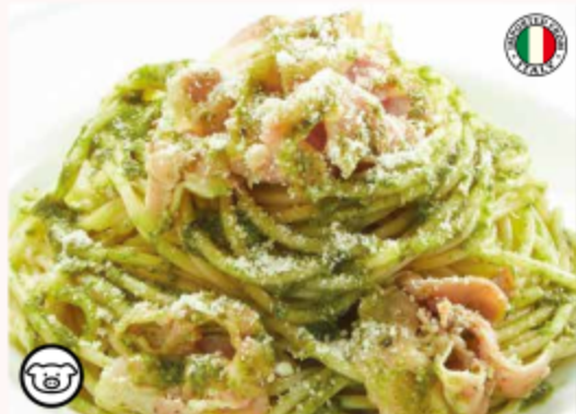
PESTO GENOVESE 意式青酱培根意大利面 Flavourful Pesto Sauce with Bacon and Cheese