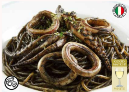
SQUID INK 墨鱼汁意大利面 Squid Ink Sauce with Squid