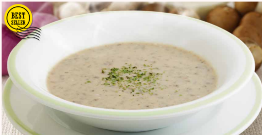
MUSHROOM SOUP 蘑菇奶油浓汤 Creamy Soup made with Button Mushroom