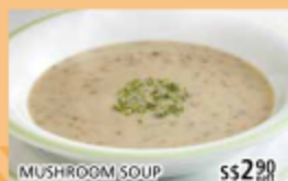
MUSHROOM SOUP S$290 nett