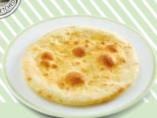
ORIGINAL FOCACCIA 披萨包