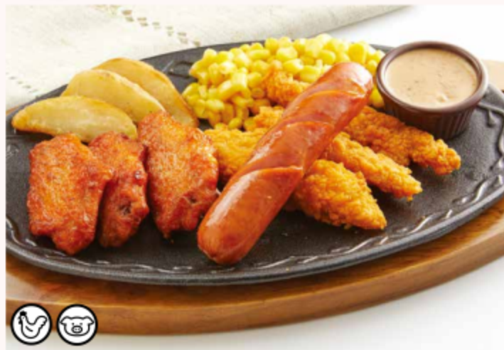
GRILL COMBO 烧烤拼盘 Chicken Assortments with Pork Cheddar Sausage and sides