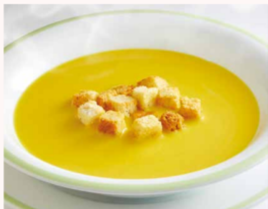
PUMPKIN SOUP 南瓜奶油浓汤 Creamy Soup made with Pumpkin