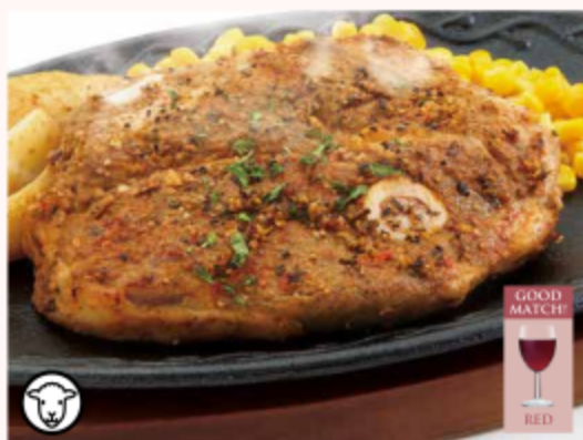
TUSCAN LAMB CHOP 意大利烤羊排 Tuscan-style marinated Lamb Chop