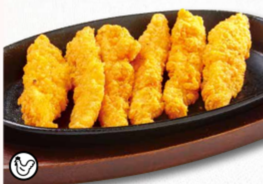
CRISPY CHICKEN 香脆鸡柳 Crispy and flavourful Chicken

CIPOLLATA 意式清香洋葱 (加半生熟蛋) Sliced Onion with Poached Egg and Bacon Bits $$390 nett