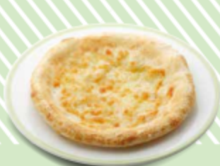
CHEESY FOCACCIA 芝士披萨包