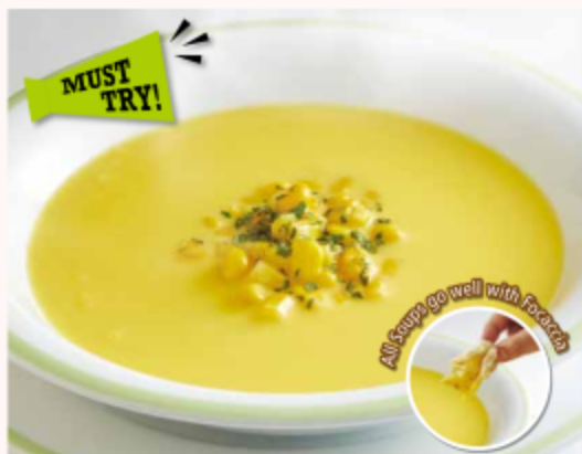
CORN CREAM SOUP 玉米奶油浓汤 Creamy Soup made with Corn