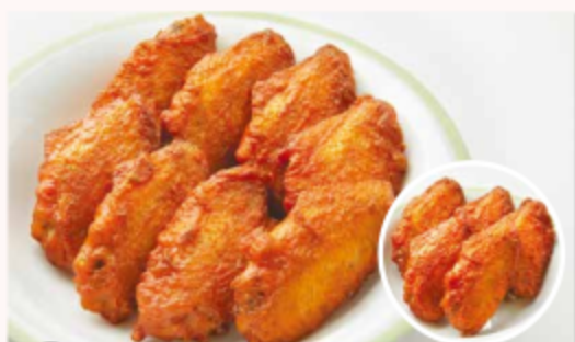
SAIZERIYA'S ORIGINAL RECIPE Chicken marinated in Spices and grilled to golden perfection